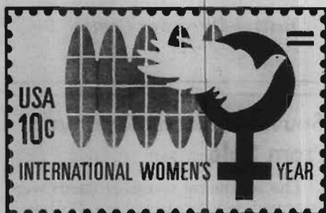
Image area: 1.44 x 0.84 inches. Issued in sheets of 50. Colors: Yellow, light blue and dark blue. Marginal markings: Three plate numbers, Mail Early in the Day and Mr. Zip. Initial printing: 140 million. Designer: Miriam Schottland.

Collectors: Request first-day cancellations from: "IWY Stamp, Postmaster, Seneca Falls, NY 13148" (see PSM, section 257.2). Requests must be postmarked no later than August 26, 1975. Selected mint stamps will be available at the Philatelic Sales Division, Washington, DC 20265, beginning August 27, 1975.