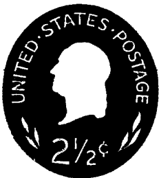
Color of Stamp: Blue

The 2½-cent stamped envelope will be available on and after May 31, 1960, at post offices for use by approved permit holders. This item will be available in sizes No. 6¾ (3⅝ by 6½ inches) and No. 10 (4⅞ by 9½ inches) in PRECANCELED FORM ONLY . Detailed instructions for requisitioning the 2½-cent stamped envelopes will be announced later in the POSTAL BULLETIN .