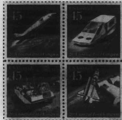
Copyright U.S. Postal Service 1989

Do Not Place on Sale Before November 28, 1989