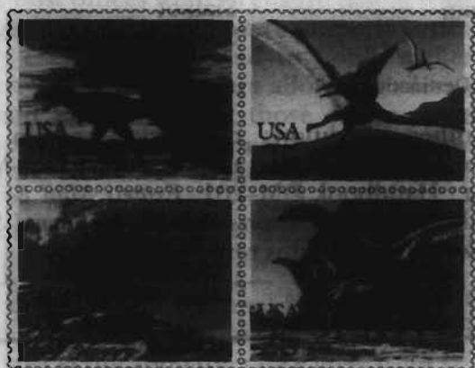
Copyright U.S. Postal Service 1989

Do Not Place on Sale Before October 2, 1989