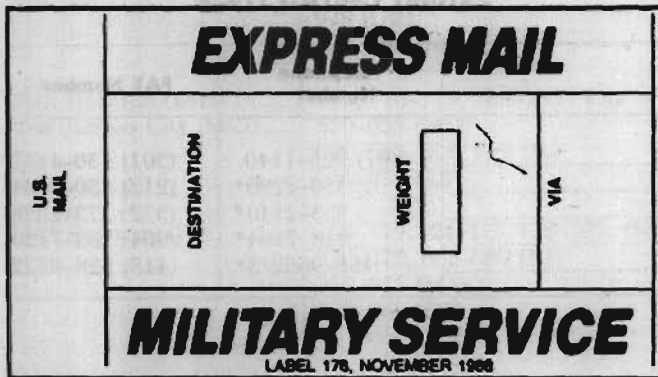
EXHIBIT A—LABEL 176

The EMMS sack going to a domestic massing point must have Tag 176, Express Mail Military Service, attached to the domestic Express Mail Service sack to ensure that the dispatching offices handle the EMMS separately from domestic Express Mail Service shipments (see Exhibit B below).