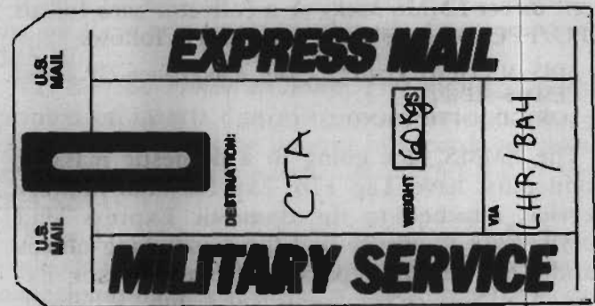
EXHIBIT C—TAG 176-B