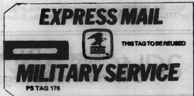
EXHIBIT B—TAG 176

As mentioned above, outside pieces (OSPs) must be kept to a minimum. However, when it is necessary to dispatch an OSP, the acceptance office must affix a Label 176, Express Mail Military Service, (see Exhibit A above) to the OSP. In some cases, OSPs are not authorized for entry to certain coun-