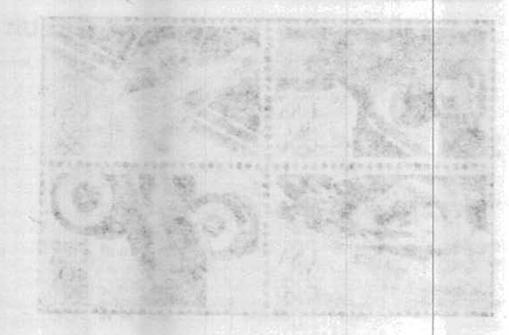
CBOT solvase lation & U triplinges