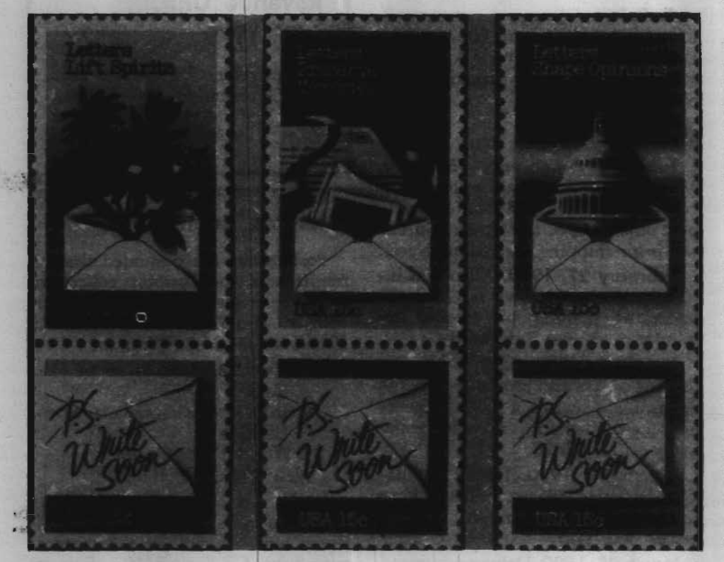
Do Not Sell Before Feb. 26, 1980

three-pair set of postage stamps, focusing on the importance of letter writing, is being issued during National Letter Writing Week.