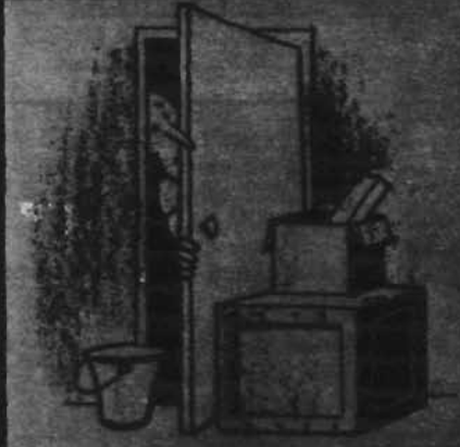
Don't block doors or exits