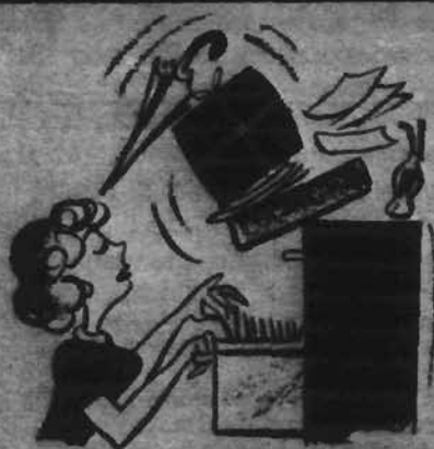
Don't store materials on top of cabinets

Good housekeeping helps keep accidents down at work and at home