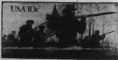
George Rogers Clark, Vincennes, 1779